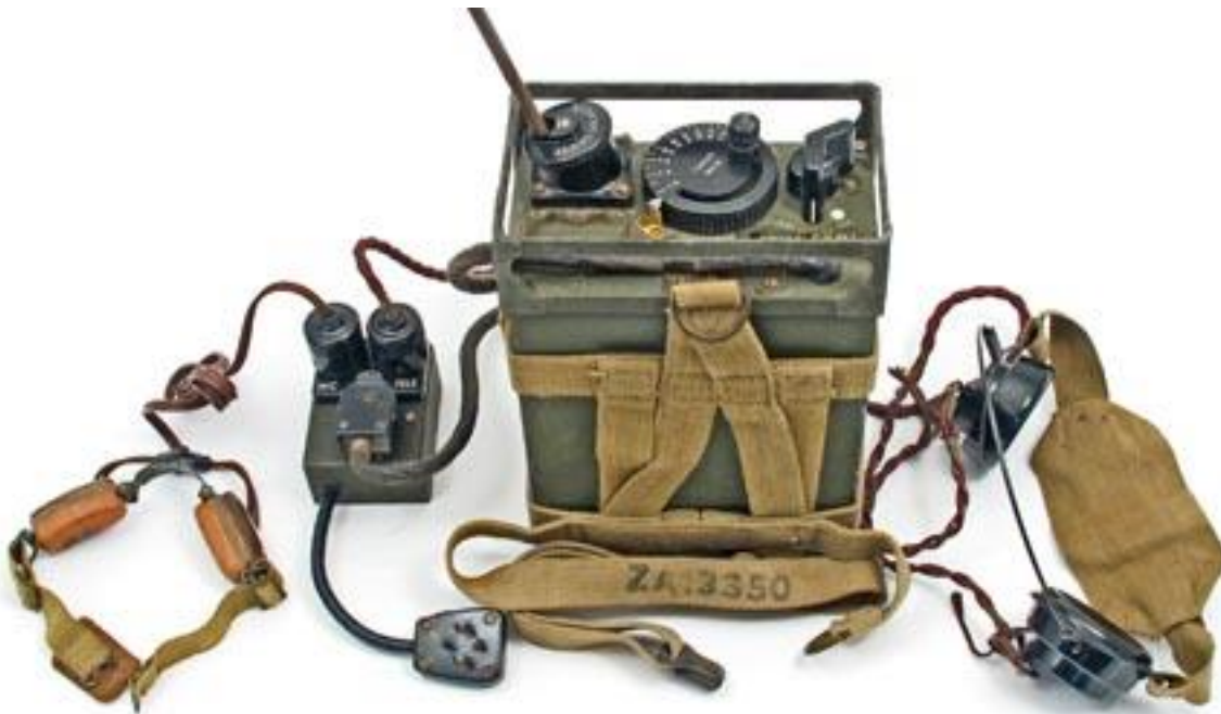
W.S. No. 38. From "Wireless for the Warrior". All this for 20 mw on AM!